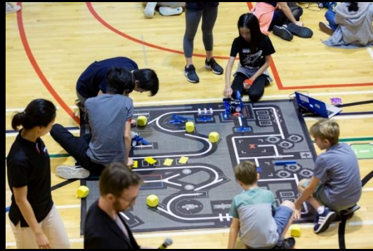
Practice in Stadium