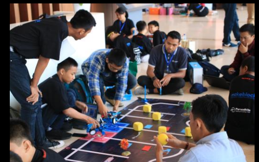
Practice before Competition