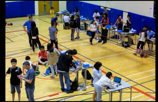
Pits in School