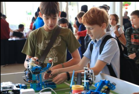
Science Day in School