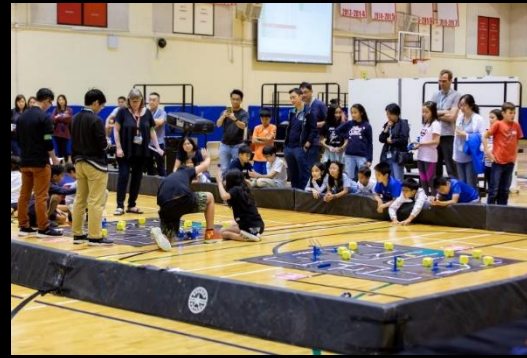
Competition in School