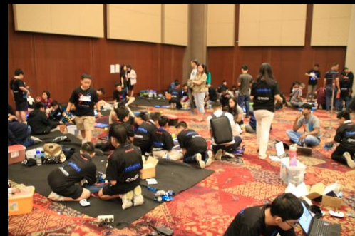
Practice before Competition